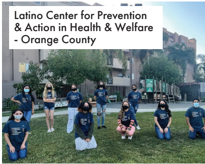
Latino Center for Prevention & Action in Health & Welfare - Orange County

Youth from Latino Center for Prevention & Action in Health & Welfare met with local council members to share their personal stories of how substance use impacts their lives and community. Participants attended city council meetings to give