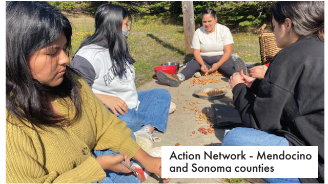
Action Network - Mendocino and Sonoma counties

This Orange County-based partner collaborates with low-income immigrant Latinx youth in Santa Ana to implement a youth-led SUD education campaign. Their goal is to foster youth leadership and create participatory mechanisms that promote risk prevention and drive system-wide changes to better address SUD-related health needs and reduce substance use among youth in the city and County of Orange.