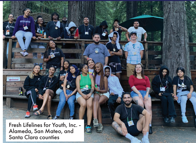
Fresh Lifelines for Youth, Inc. - Alameda, San Mateo, and Santa Clara counties